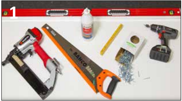
TOOLS NEEDED FOR INSTALLATION.

The boards should acclimatise inside designated room for 24 hours before fitting. Boards to be stored horizontally and on a solid underlay.