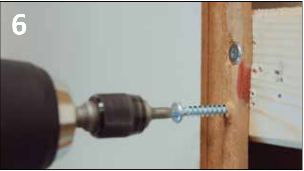
DOUBLE FIXING IN HORIZONTAL BATTENS.