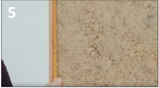
200MM BETWEEN FIXINGS IN VERTICAL BATTENS. USE SCREWS OR BRADS.