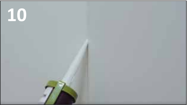
ACRYLIC MASTIC IS RECOMMENDED FOR INTERNAL CORNERS.