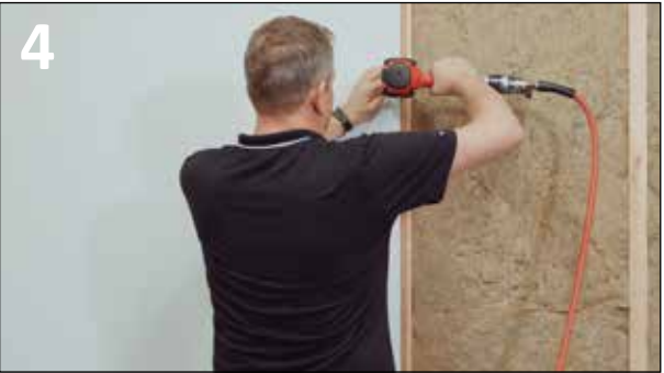
FIT LEFT TO RIGHT FROM A CORNER, OR FROM RIGHT SIDE OF A DOOR OPENING.