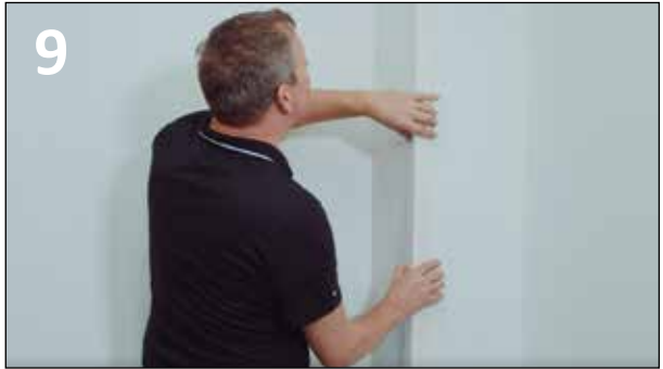
THE WALL CAN BE FITTED WITHOUT INTERNAL CORNER TRIM. FOR EXTERNAL CORNERS, OUR FLEXILIST CAN BE USED.