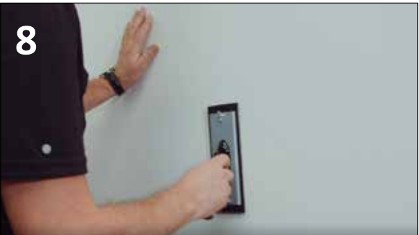
AFTER EACH BOARD IS FITTED, SAND LIGHTLY OVER JOINT BEFORE PAINTING OR WALL PAPERING.