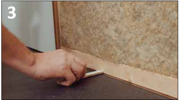
LIFT BOARDS 5MM TO 10MM UP FROM FLOOR.