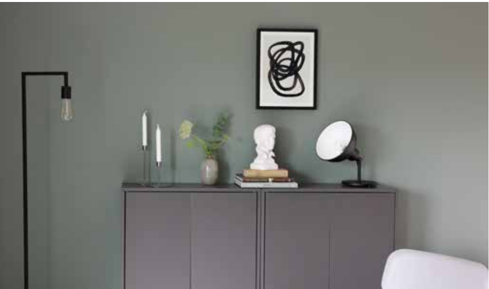
Huntonit Pro Wall is suitable for both painting and wallpapering.