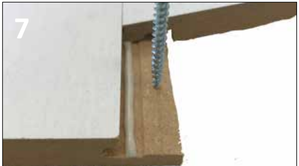
USE A 1MM STRING OF WOOD GLUE ALONG THE JOINT PROFILE. EACH PANEL MUST BE COMPLETELY FIXED TOP, BOTTOM AND SIDES BEFORE NEXT PANEL IS MOUNTED.