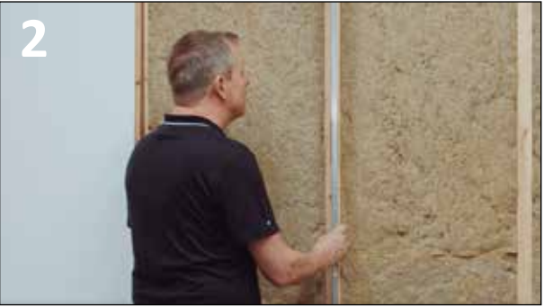
MAKE SURE WALL IS STRAIGHT AND LEVEL.